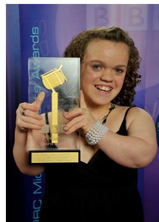
BBC Midlands Sports Personality of the Year 2008