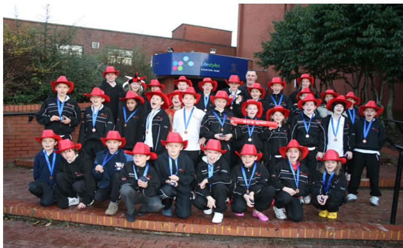
The Team Celebrate their performance in Liverpool

The teams success was just one of a number of news reports to hit the local press with extensive coverage in the Sutton Coldfield Observer. The result in Liverpool is a real credit to all the coaching staff at the club