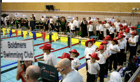
The team turnout in style for the Parade