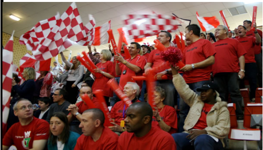
KELLY'S HEROES - Red had a whole new meaning for Liverpool on Nov 30th